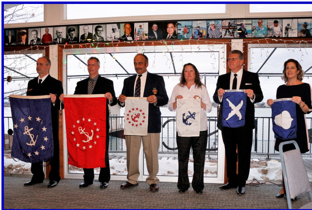
2020 Presentation of Officer Flags

Niagara Sailing Club 3619 East River Road Grand Island, NY 14072 716-773-2305 www.NiagaraSailingClub.com Follow us on Facebook